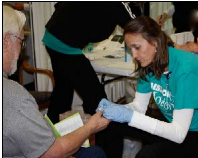
Getting the stick: Healthy Community project technician takes a blood sample for screening.

Healthy Neighborhood program organizers have been delighted with the response to this unique health initiative. As expected, the majority