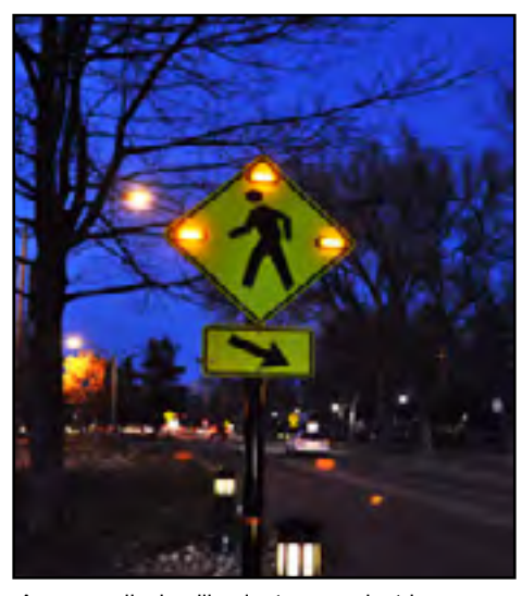
A crosswalk sign illuminates a pedestrian walkway on the CC campus.

Reduce lanes of several streets surrounding the campus